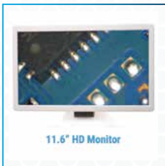
11.6" HD Monitor